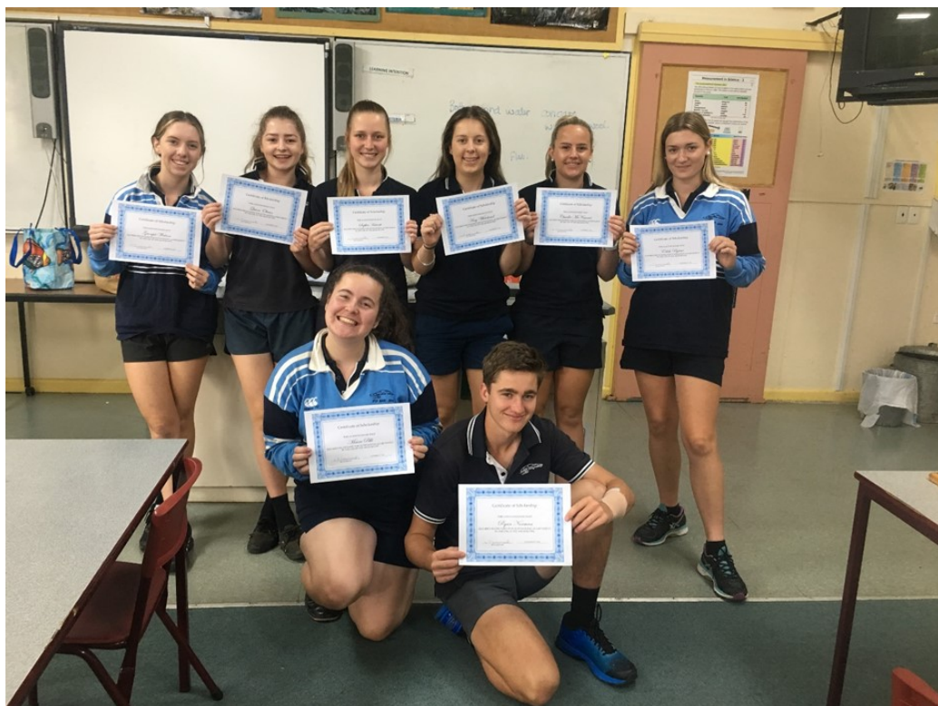
The 2019 year 12 head start biology students receive their certificates for microscope Technique

Sessions start on the 26th November and are on a Monday or Thursday. Registration forms will be available from either the Senior or Junior Campuses.